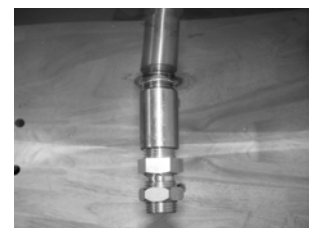
Fig. 1 Using Pan