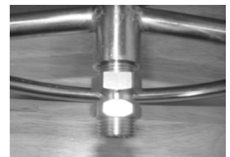
Fig. 2 Using Only Ring